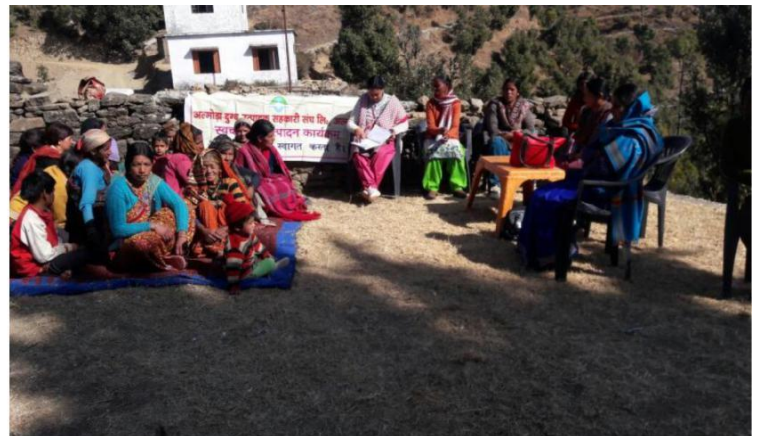
Launching awareness programme on Clean Milk Production among women dairy members