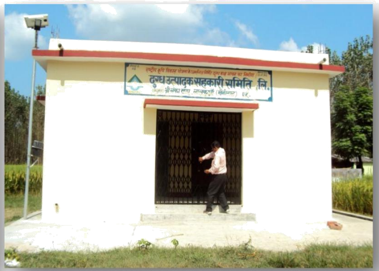
Construction of milk rooms in different villages for smooth functioning of milk collection at village level.